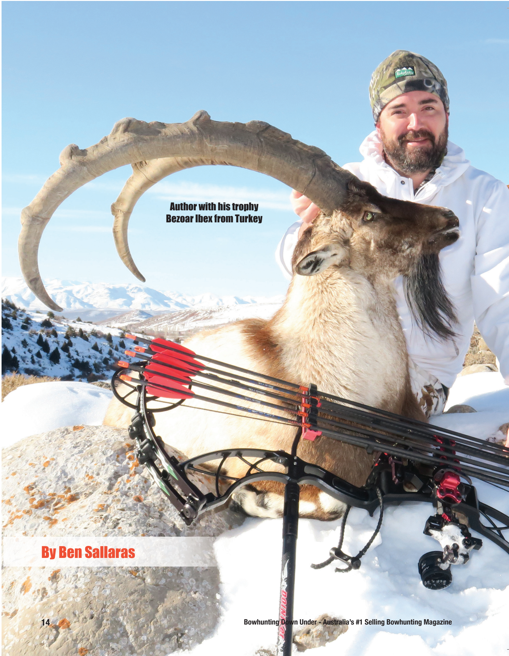
Author with his trophy Bezoar Ibex from Turkey